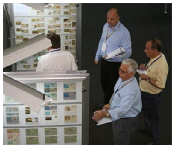
The Postal Stationery Jury Team at work at EFIRO 2008

When you see new postal stationery exhibitors in your country we strongly suggest that you make contact with them and give them advice on how to develop their exhibits. When the exhibits are ready for the next level (national/international/world) encourage the exhibitor to exhibit at this level.